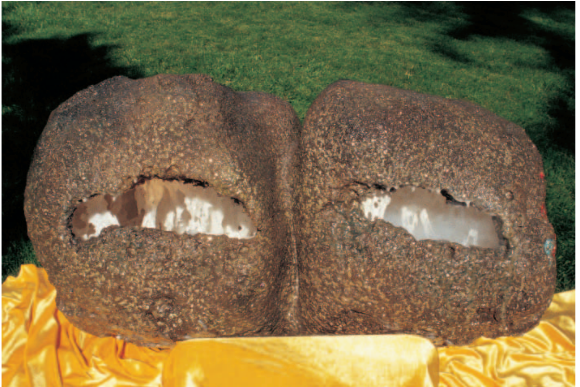
Mysterious Boulder with Mist 神秘石霧