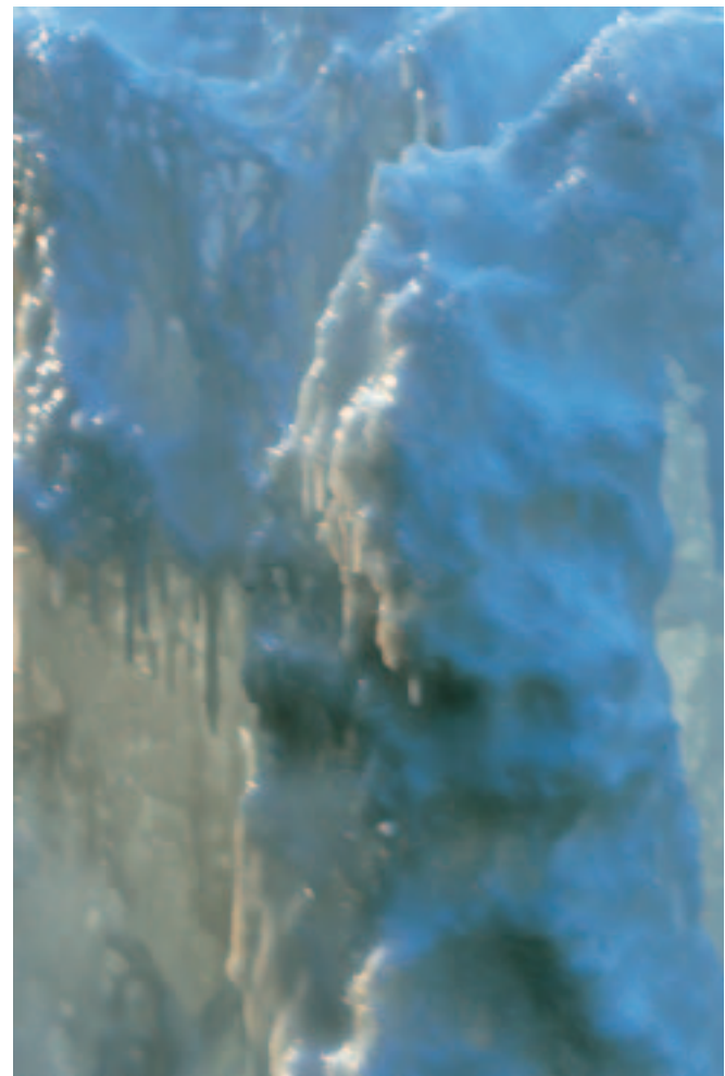
Hanging Ice Stream in Thick Mist 冰流倒懸霧氣濃