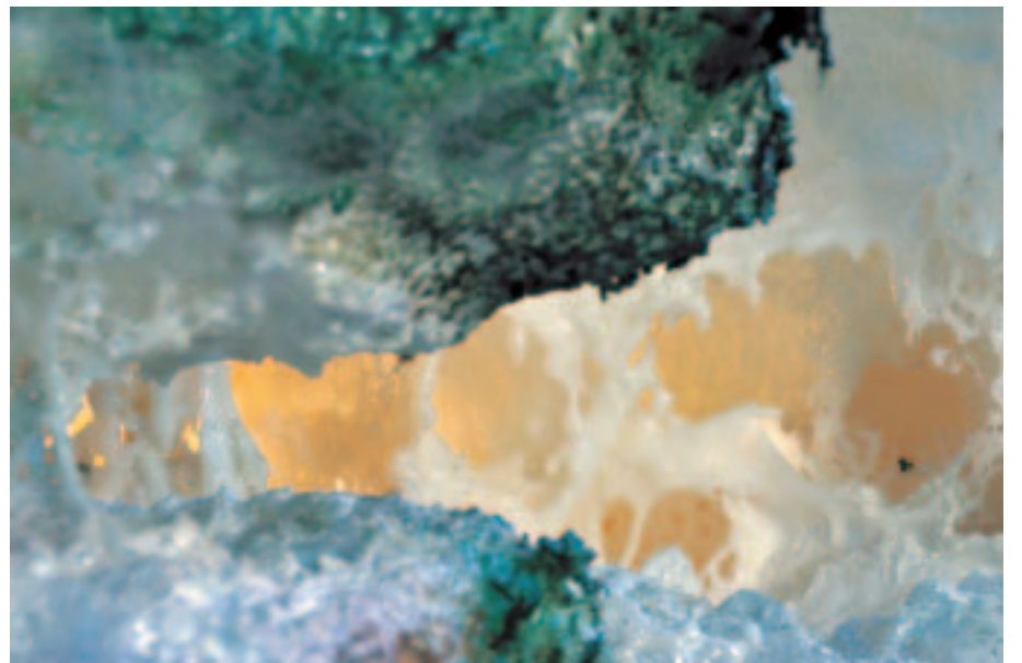
How Could Such Depths Be Fathomed? 深豈能測