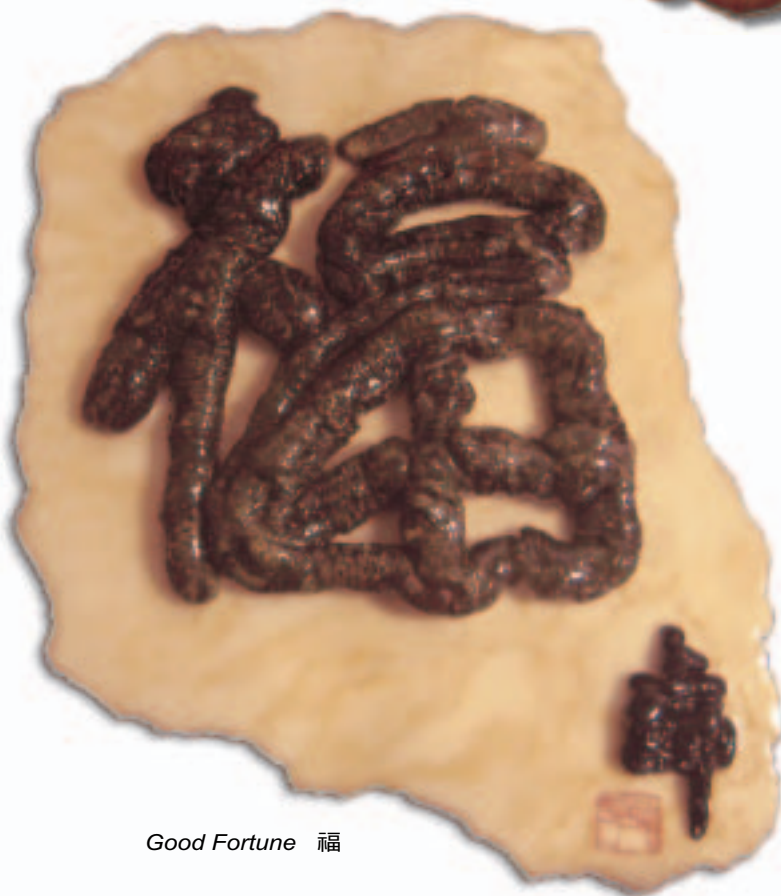
Good Fortune 福