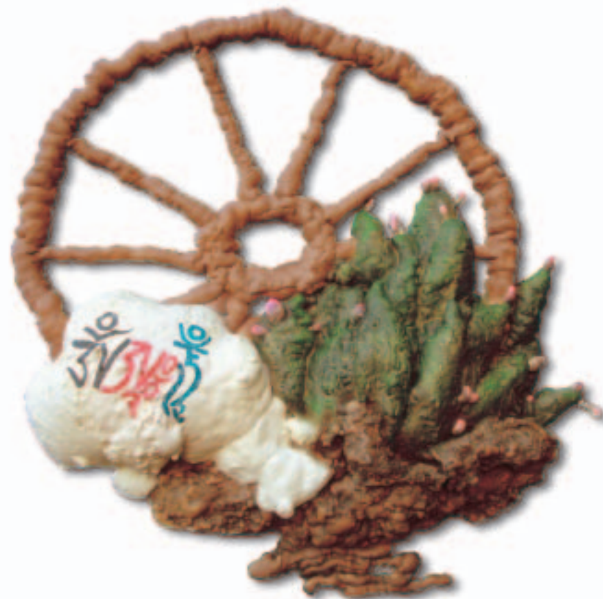
Mani Treasure 瑪尼藏