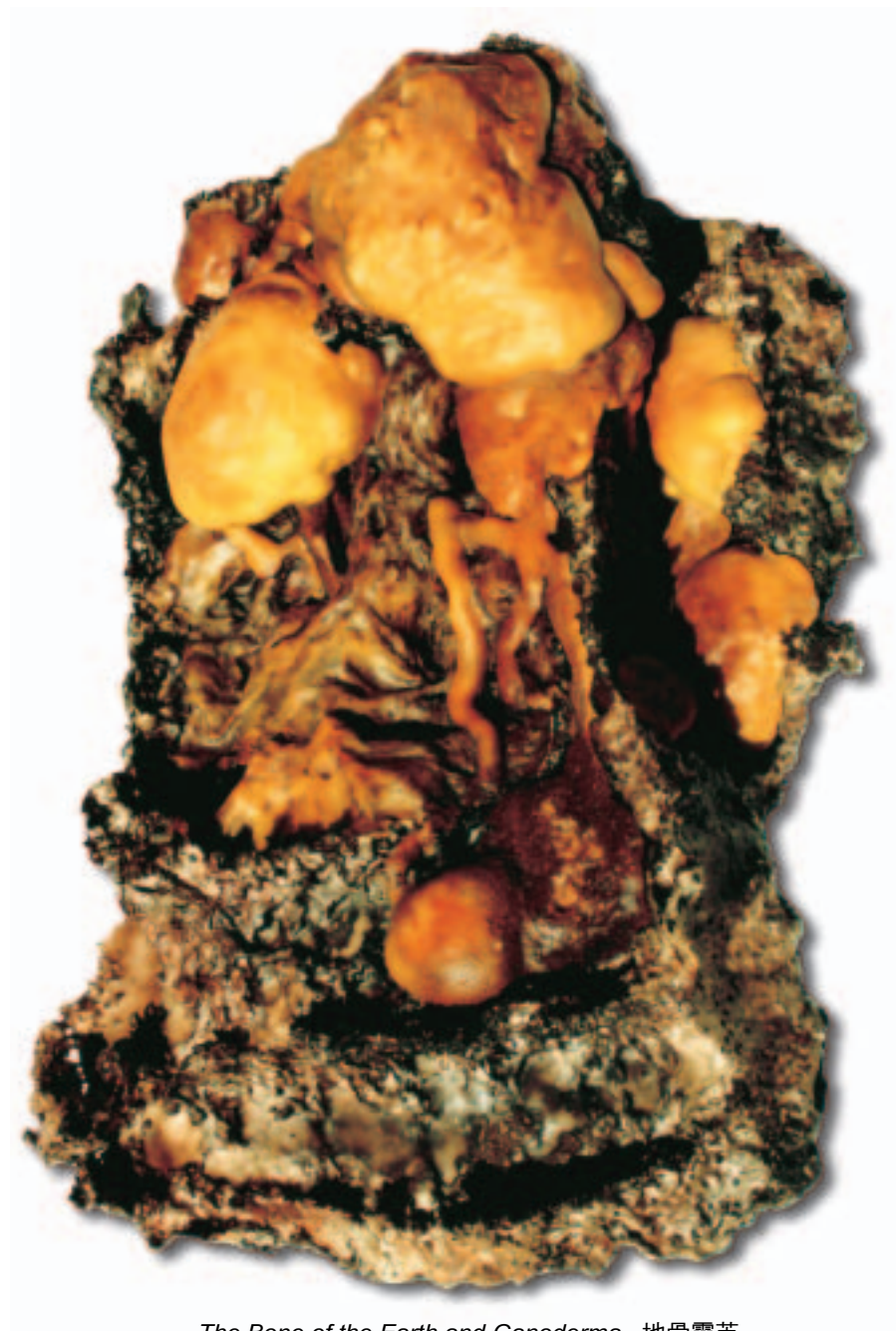
The Bone of the Earth and Ganoderma 地骨靈芝