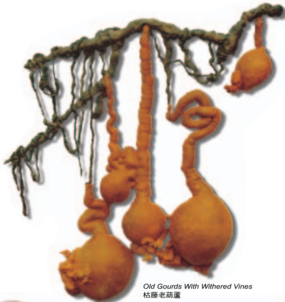
Old Gourds With Withered Vines 枯藤老葫蘆